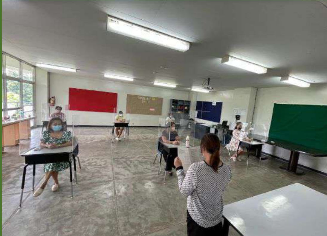
Room with 1 proctor and 6 test-takers (desks are 2 meters apart)