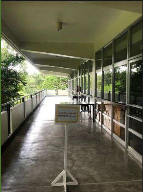
Hallway outside testing room