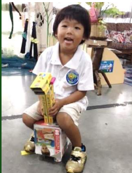
One of our preschool learners riding his new giraffe

After today we have just 4 Friday's until CIS breaks up for the academic year. We have much to celebrate as we reflect upon this academic year.