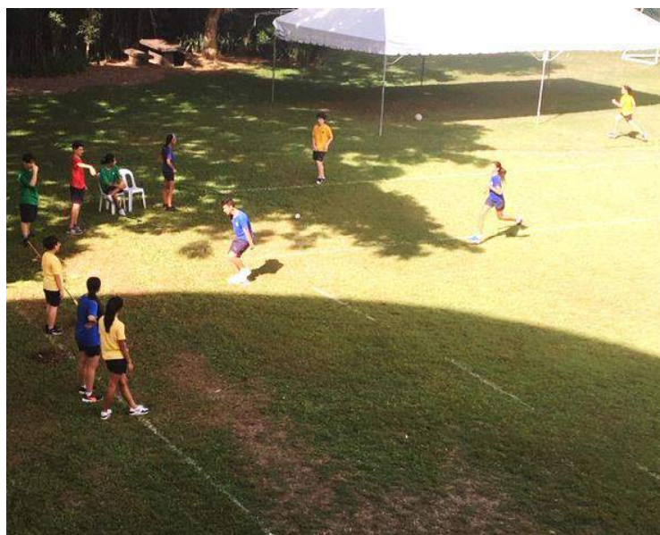
Grade 7 PE class in the middle of a kickball game.