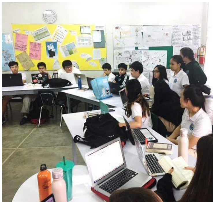
Our Grade 10 students engaged in a student-directed Harkness discussion. They are wrestling concepts such as courage, insecurity, and guilt in the current novel they are studying.