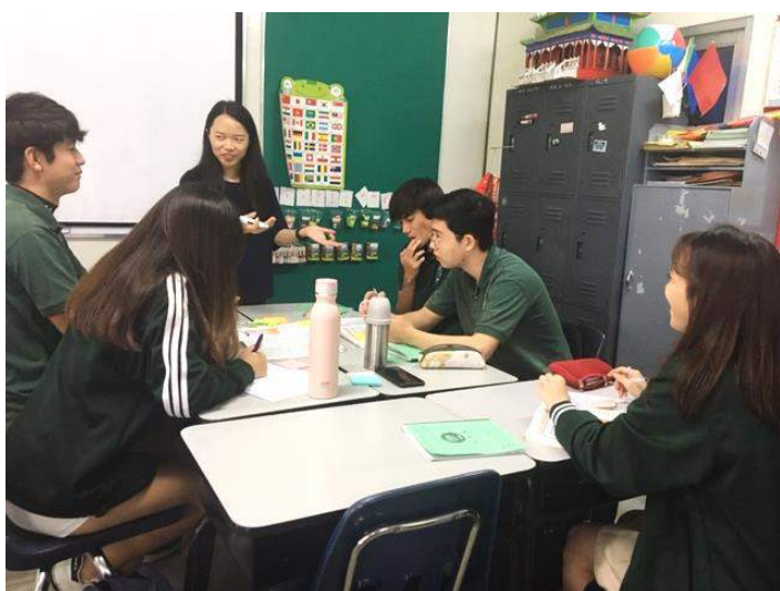
Ms. Zou leading a group of active IB Mandarin students.

Allow me to just highlight a few examples I encountered on a series of random classroom visits on Wednesday morning. These images demonstrate the active, student-centered learning engineered by our teachers each day.